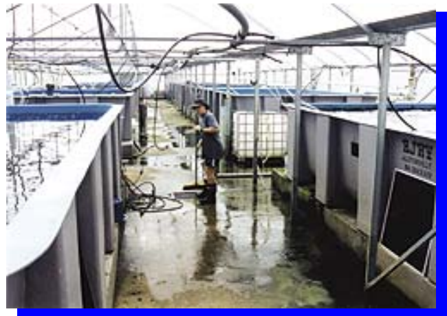
The 10 x 30,000-liter barramundi tanks in the twin-span polyhouse at Tailor Made Fish Farms Pty Ltd., Port Stephens, near Newcastle, New South Wales. The 10 tanks have the capacity to produce at least one ton/week. Current harvest is 600 kg/week.