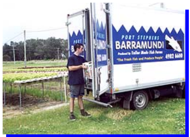
Lettuce is delivered to a nearby supermarket on a regular basis and urgent orders are quickly filled if a supermarket runs short.