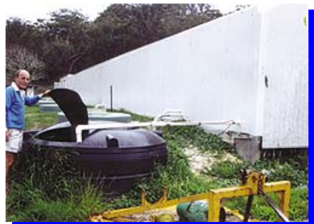
Peter Nicholson lifting the inspection porthole on the fish waste settling tank adjacent to the barramundi polyhouses.

The units are made by a local engineer and cost from A$2,500 to A$3,000 (around