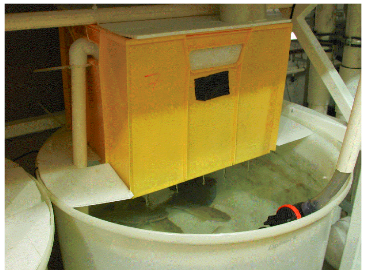
Figure 3 (below): Fish rearing component of a single Aquaponic test unit, showing fish tank containing fish and submersible water pump, return pipe and valve from hydroponic gravel bed and biofilter (yellow box with airlift feed pipe at left).