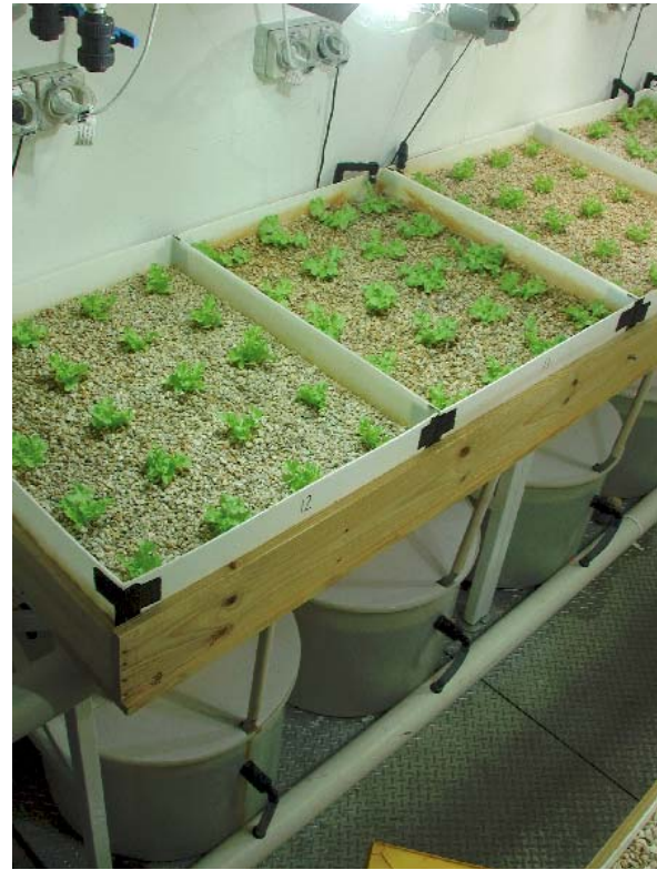
Figure 2 (above): Aquaponic test system, showing Aquaponic units consisting of fish tanks (below) and hydroponic gravel beds containing young lettuce seedlings (above).

What are these questions and how have I gone about answering them? As I said, the ultimate question is... how many lettuce plants are required to be grown so that the amount of waste produced by the fish is exactly balanced with the amount of nutrients used by the plants? A number of sub-questions are posed from this single, ultimate question. These sub-questions include... what is the average FCR of Murray Cod fed on 43 % protein feed? How much waste is therefore