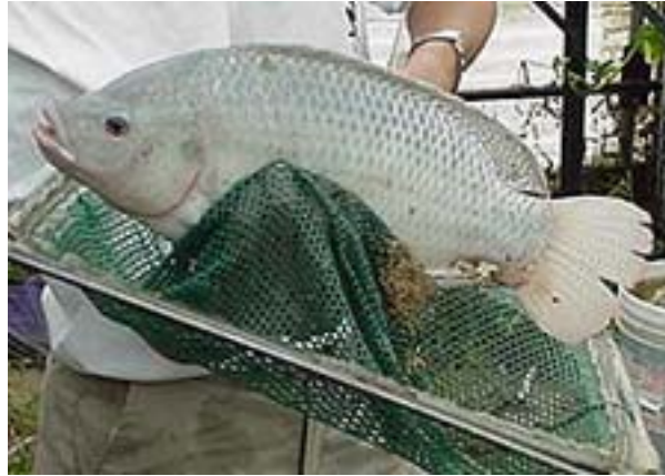
Above: Pearl tilapia Below: basil

and plants and, also, plants grown for their essential oils used in manufacturing and pharmacology. Holopathic medicine has seen a 30 year up-swing into wide-spread acceptance limited, in part, by the unavailability of fresh (as opposed to dried) plants on a year-round basis, which could be solved by greenhouse production. New plants are discovered almost daily that have pharmacological properties but are normally available only in small quantities and often in far-off lands. Aquaponic greenhouse production guarantees a consistent, high quality source of the plants that the pharmacological market craves.