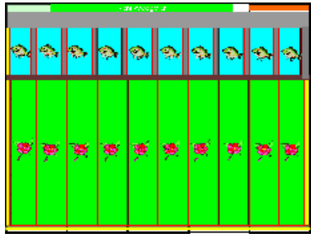
10 separate aquaponic systems in the Phoenix Foods LLC Greenhouse complex

The controlled environment (greenhouse) commercial aquaponic industry is in its infancy, both in the U.S. and around the world. Currently there are less than five large-scale (+1 acre) facilities around the world and only two in the U.S. While several smaller operations are scattered around the country, most are on the "family farm" scale, rarely exceeding \frac{1}{4} acre.